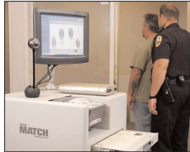
PrisTrak System being used in a prison holding cell to track prisoners.

With PrisTrak, Avoid Uncertainties Related to Identity Throughout the Life Cycle of a Prisoner and Rest Assured the Wrong Person will not be Released